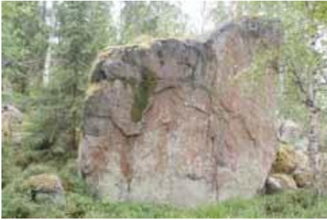
In a Face