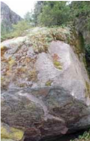
Off Wolf and Man